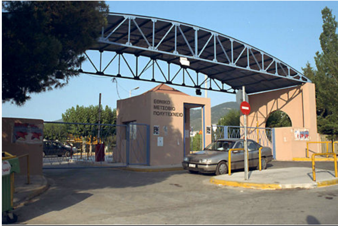
NTUA ZOGRAFOU CAMPUS GATE (ENTERING THE CAMPUS FROM THE ZOGRAFOU AREA, ON FOOT – BUS No. 222 (8 th STOP))