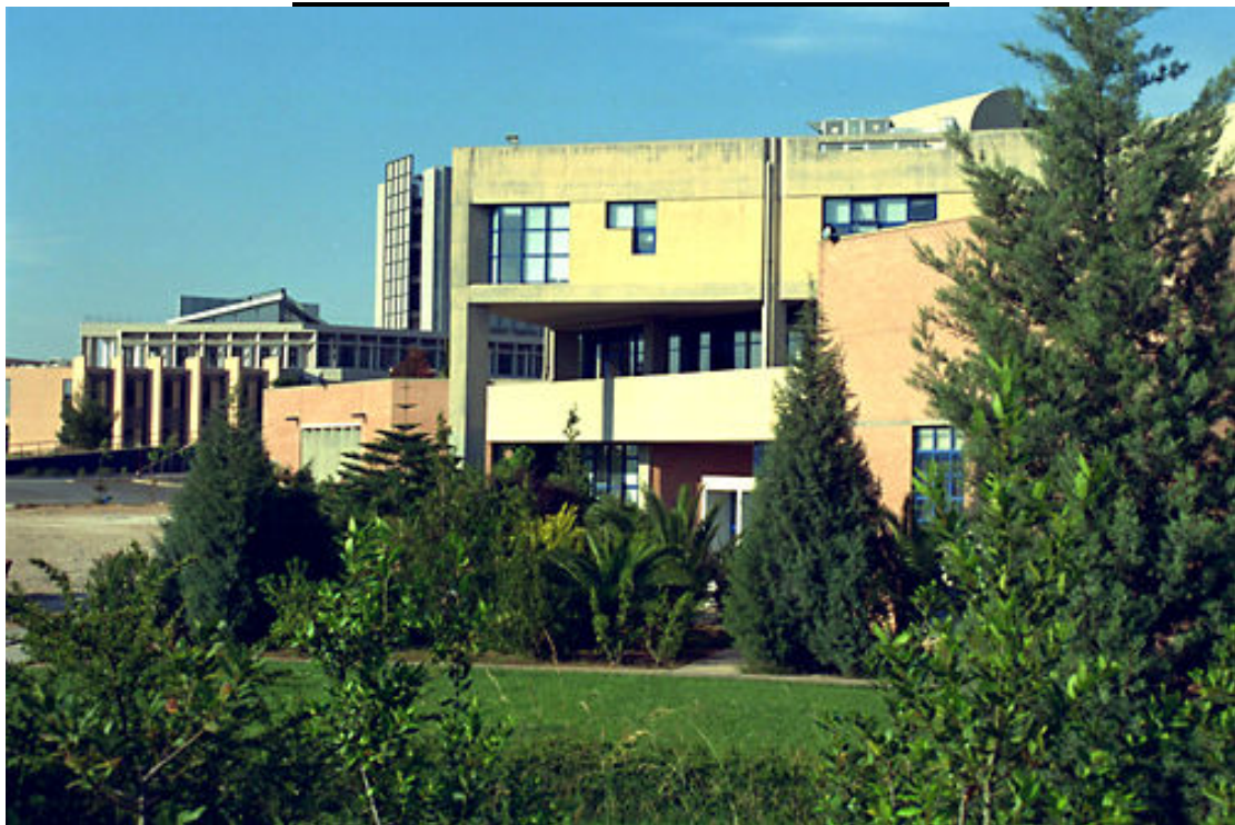
TWO VIEWS OF THE NTUA ADMINISTRATION BUILDING